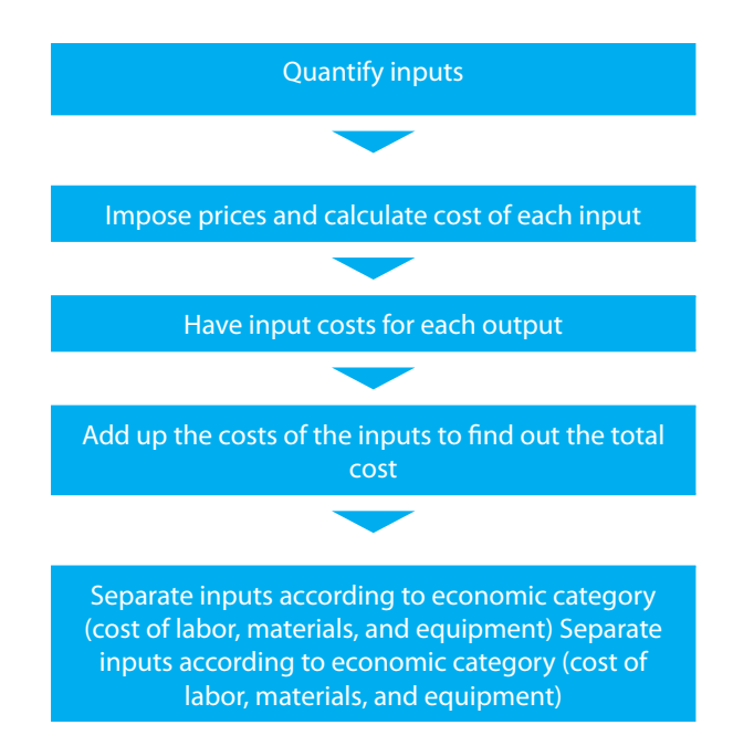
Diagram 2.2: Costs associated to achieving the outputs of the services

If the expected costs exceed the available resources, the expected outputs and results should be adjusted.